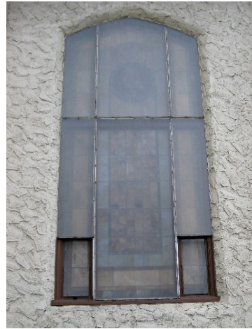
Exterior view of stained glass windows

How wonderful it would be to showcase God's love through our beautiful stained glass windows from the inside and outside of our building.