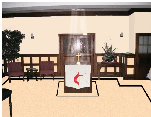
Possible updated Narthex

How wonderful it would be to showcase God's love through our beautiful stained glass windows from the inside and outside of our building.